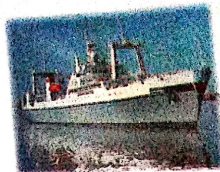
Different Means of Transport

Roads, railways and vehicles are known as means of travel and transport . They are used to carry people and goods from one place to another. We can put different means of travel and transport into three groups —